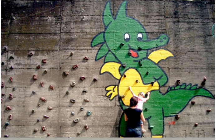
From Industry to parks Zhongshan shipyards - China, Concrete Plant Park - New York, Slides at Duisberg Nord Landscaftspark Germany, and at bottom climbing wall at Duisberg Nord